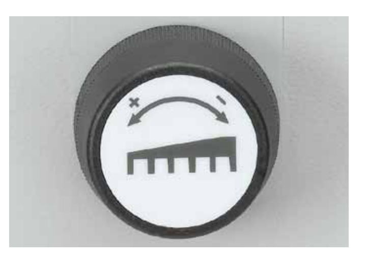
ELECTRONIC HAND WHEEL Electronic hand wheel for manual backgauge positioning with infinitely variable speed control (from very slow to very fast).