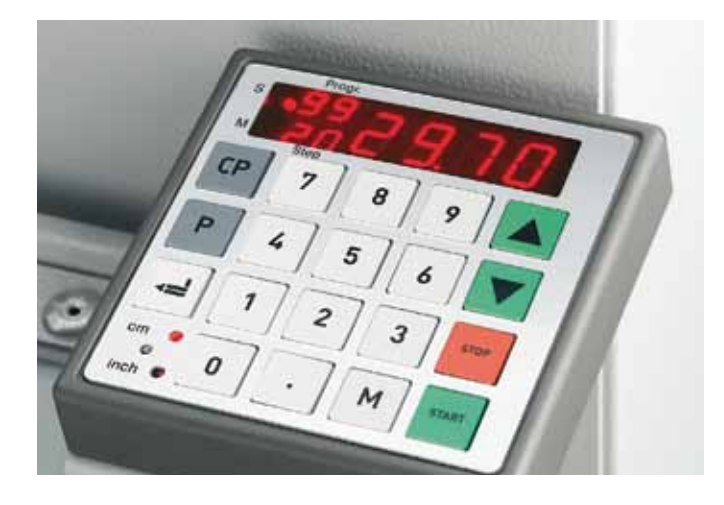
EP BACKGAUGE CONTROL Fully programmable backgauge control module with digital measurement readout, 10 push button key pad, and memory key for repeat cuts.