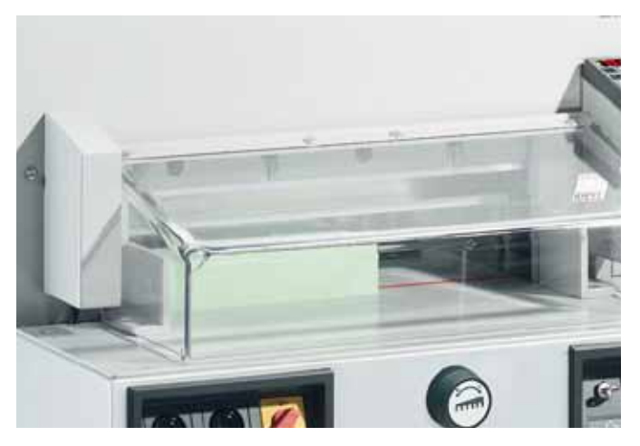
SAFETY GUARD The electronically secured front safety guard swings out of the way easily and allows safe and convenient cutting.